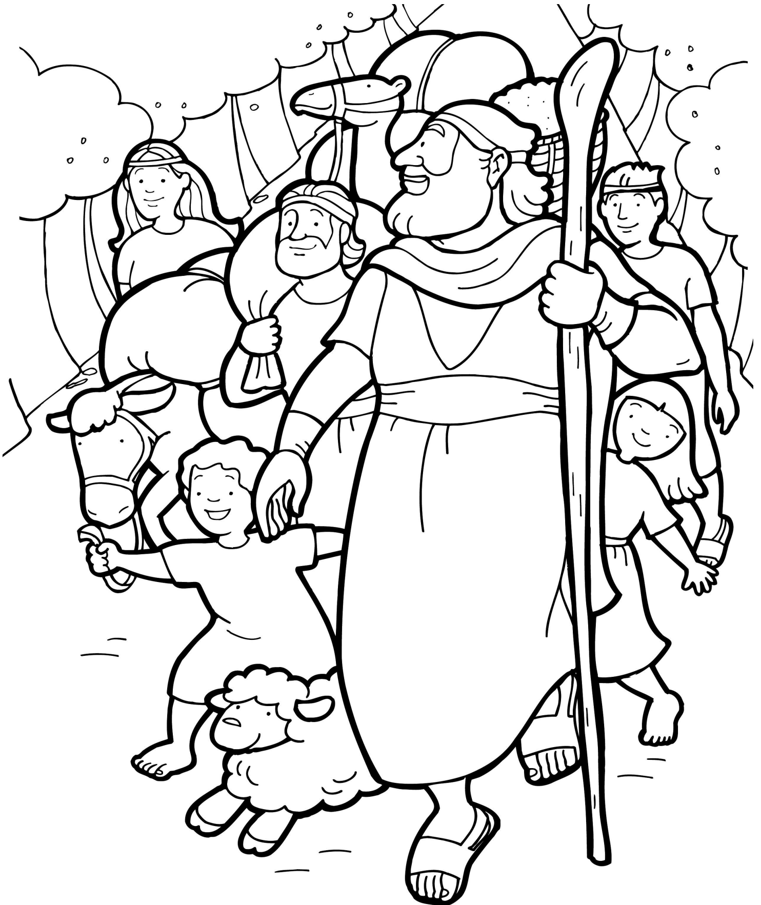
God makes a path through the Red Sea. Exodus 14:1-31