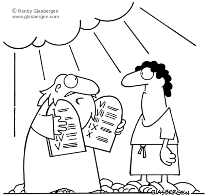
"I downloaded them from a cloud."