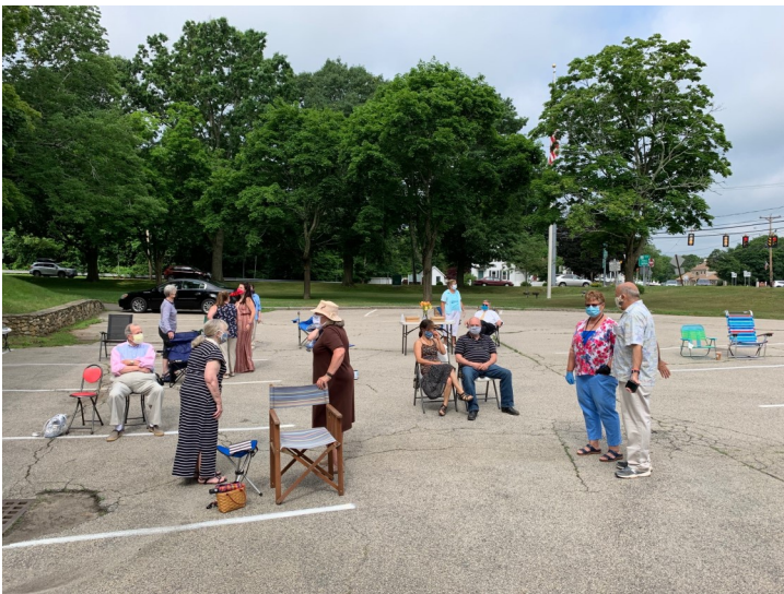
Outdoor Worship July 5