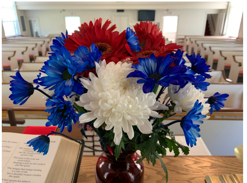
Sanctuary Flowers from our Flower Committee