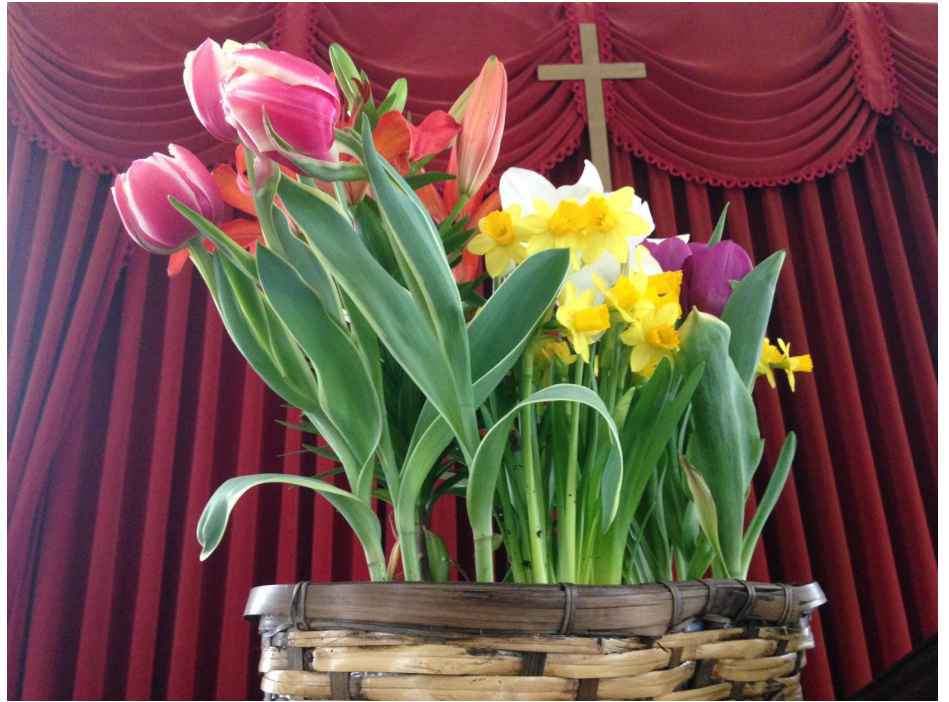
Sanctuary Flowers from our Flower Committee