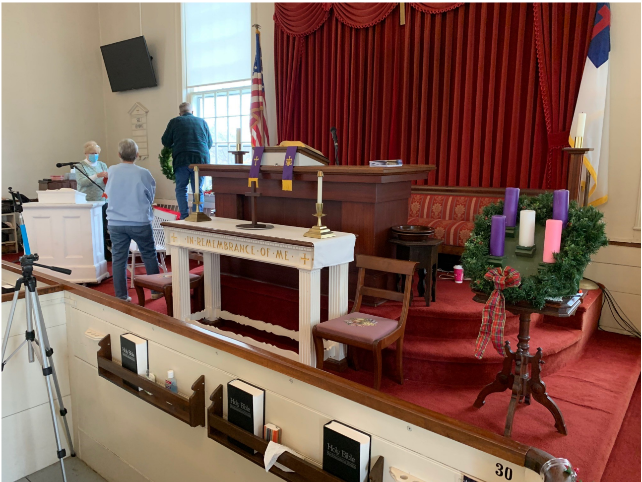
Hanging of the Greens (above)