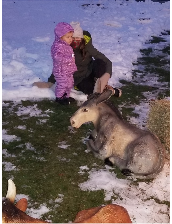
Youth Fellowship Live Nativity