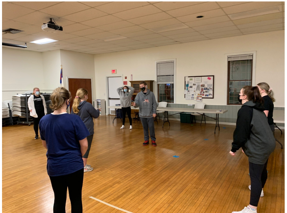
Youth Fellowship Rock-Paper-Scissors (socially distanced)